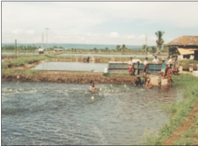
A typical fishpond in the Philippines; this one raises milkfish