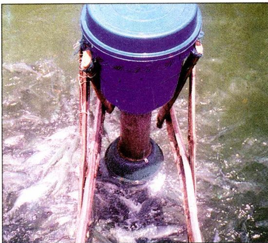
With automatic demand feeders, feeds are released as fish demands, hence, wastage is minimized.

for example compared approaches to feeding in China and Japan. China's fish production is largely based on polyculture and integrated farming systems. Livestock and agricultural crops serve as source of nutrients for the cultured finfish as pond fertilizers or low-protein supplementary feeds. Japan with limited area, employs intensive monoculture systems and uses high-cost nutritionally complete diets or high nutrient trashfish or shellfish. Although both farming systems may be economically viable, they have their own share of advantages and disadvantages depending on one's perspective. The former is of course, more sustainable.