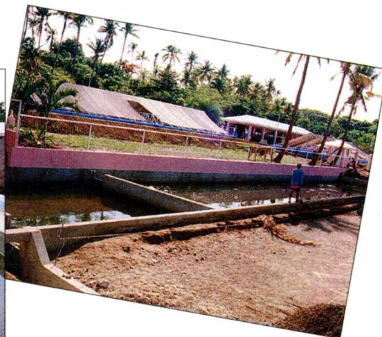
AQD's new integrated broodstock-hatchery complex has facilities for wastewater treatment.

In the same way, when water from the river is to be used for the pond, a settling pond can be installed for sedimentation before the water is pumped into the pond.