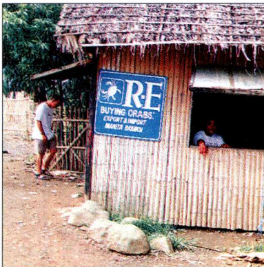
Mudcrab buying stations in Capiz