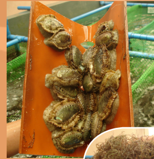
Abalone broodstock and red seaweed in tanks

The Philippines exported 300 metric tons of H. asinina valued at US$ 1.5 million (NSO, 2012). Haliotis asinina Linne (donkey’s ear abalone, sobra-sobra , kapinan or lapas ) is the largest species of abalone found in the Philippines and has been the focus of research and development in SEAFDEC/AQD.