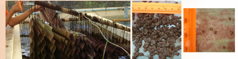
(From left) Settlement plates hanging in 1-ton tank, harvested juveniles on settlement plates and crustose coralline algae-colonized plate