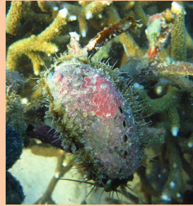
Abalone in Molocaboc, Sagay Marine Reserve, Negros Occidental

This CBRE Project has demonstrated that hatchery-bred juveniles released in suitable protected sites can enable rebuilding depleted coastal resources; supplement livelihoods; and contribute to improving the supply of abalone in local and export markets.