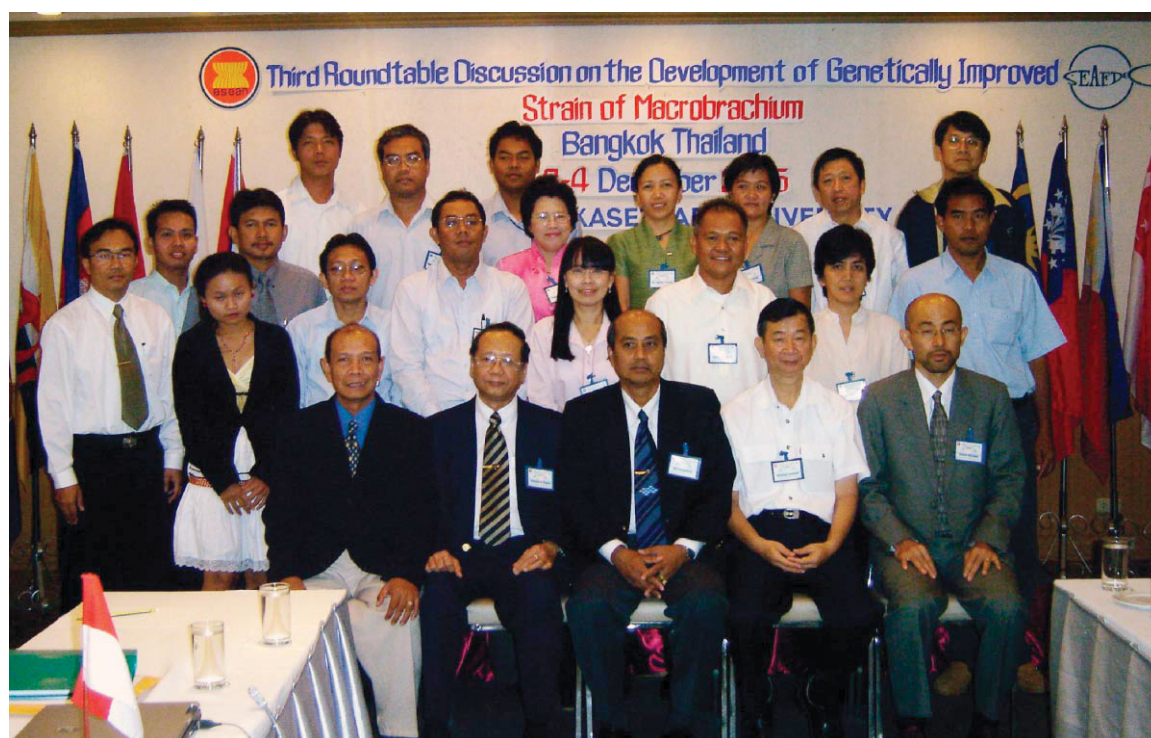
The Third Round Table Discussion Participants

The status of these activities needs to be assessed in order to develop a technology for consistent and improved production of quality freshwater prawn seedstock that will be disseminated to countries in the region.