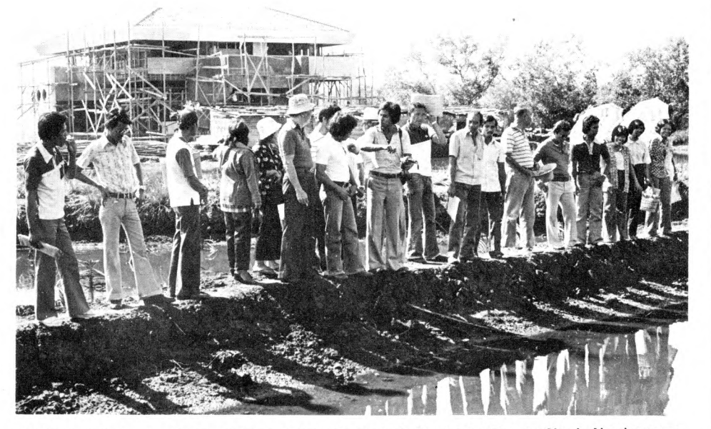
Fishfarmer trainees visit one of their colleaque's newly built pond at Butuan City in Northeastern Mindanao, Philippines. Back to back on-site farmers' milkfish and prawn culture training courses held in the Mindanao region for 98 fishfarmers closed out the 1979 SEAFDEC Aquaculture Department training programs.

The mobile training scorecard for 1979: 399 participants from 4 regions •