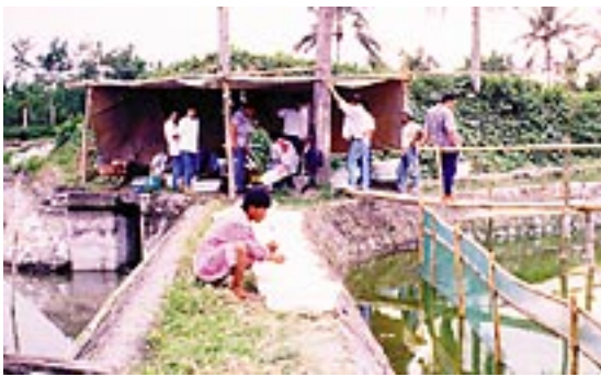
Fig. 5. Stocking should be done during early morning or late afternoon, but the best time is at night when the temperature is cool.

It is advisable to stock monosize mudcrabs to obtain a relatively uniform size at the end of the rearing period (Fig. 6).