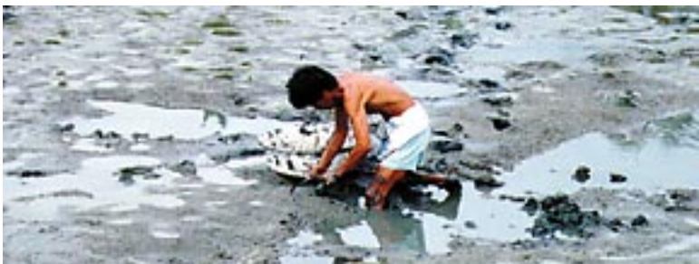
Fig.9 (below). Remaining crabs are collected by hand picking after total drainage.