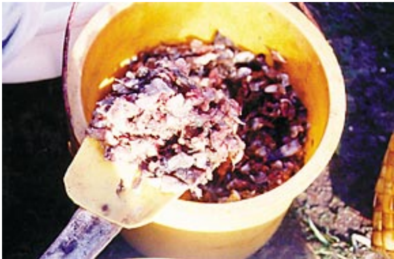
Fig. 7. Chopped trash fish, animal entrails or hides are fed to mudcrabs two times a day.

Filamentous-green algae or lumut or gulaman ( Gracilaria spp.), when readily available may be given as supplemental feed.