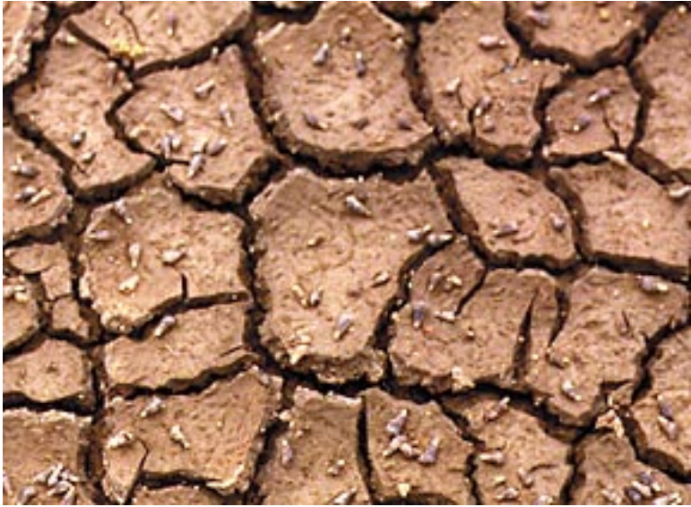
Fig.3. Pond should be drained and the bottom be allowed to dry until it cracks for about two weeks to eradicate pests and predators.