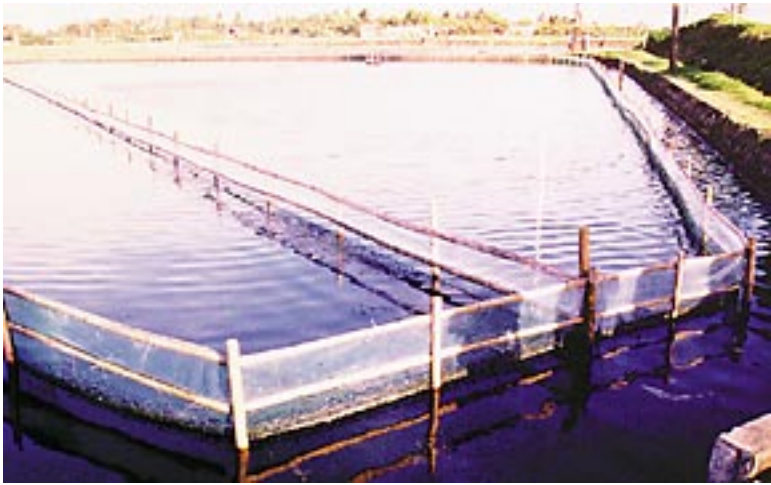
Fig.2. Plastic sheet should be installed at the top edge of the net fence to prevent crabs from escaping.