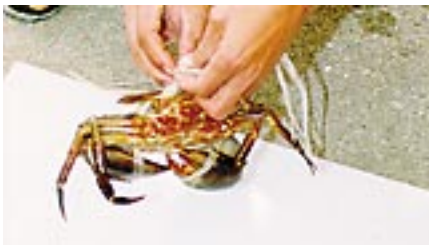
Fig.8. Pincers should be tied securely using soaked "suwak" or plastic straw.

2. Total drainage (total harvest) This is done during low tide when remaining crabs are collected by hand after total drainage (Fig. 9). Earthen mounds are examined for complete retrieval of crabs. Normally, this lasts for a day or two with the help of five persons.