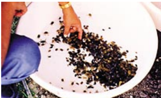
Fig. 6. Stock monosize mudcrabs to obtain uniform sizes at the end of the rearing period.