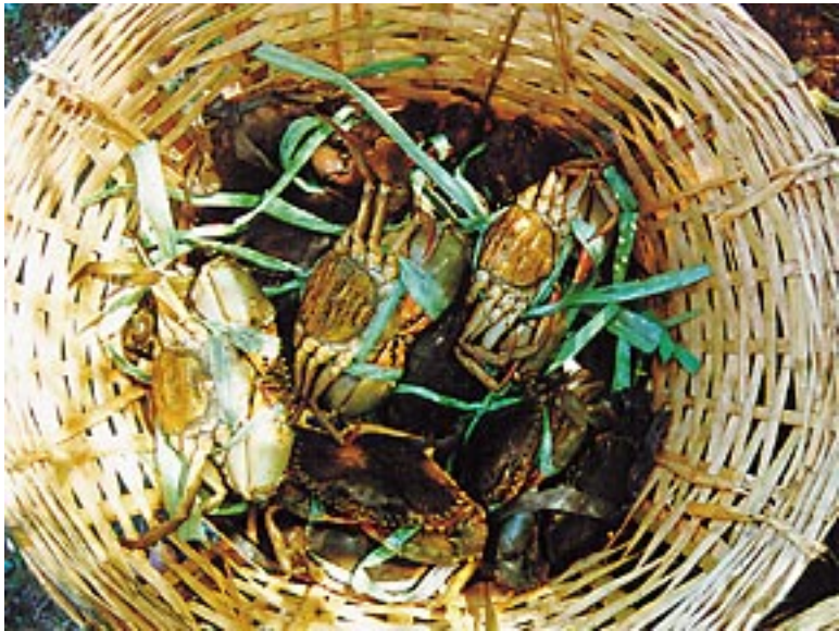
Fig. 10. “Tiklis” is a sturdy crab container for long distance travel.

Newly-harvested mudcrabs mixed or sorted by size are always tied in bunch either by kilo or by dozen pieces. Sometimes the females with maturing eggs are sorted from the males with big pincers for delivery to discriminating customers. For long distance travel, they are kept inside wooden or styrofoam boxes, and bamboo ( tiklis ) or palm ( buri or pandan ) baskets (Fig. 10). Mudcrabs are sturdy species and can stay alive for a week by simply sprinkling them occasionally with water. Prolonged holding period, however, will lessen the weight ( hagas ) or eventually cause death. Price varies by region. Mudcrabs weighing 150 to 200 g fetch P120-P180 pesos per kilo while bigger sizes (200 grams and above) reach P160-250 per kilo. Generally, female crabs with developing gonads are more expensive than males. Demand for mudcrabs remain high both here and abroad.