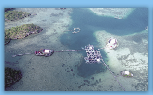
Igang Marine Substation