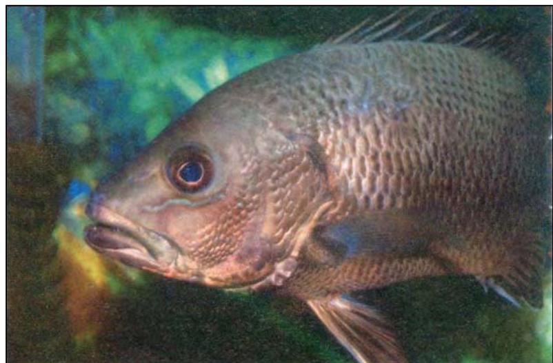
The mangrove red snapper Lutjanus argentimaculatus

length, and 0.64 g in weight. On the other hand, wild fry is about 2cm in length, and 0.15g in weight. Each fry costs about P5. Hatcheries in the Philippines include SEAFDEC/AQD, and Alcantara Group of Companies, particularly the Fish Hatchery Inc. However, AQD is producing fry only for research purposes.