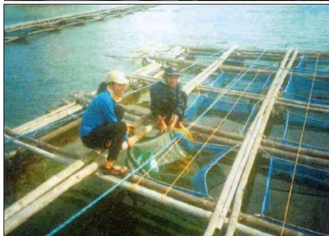
Stocking abalone juveniles in the PVC pipes used for transport (top); checking for net damage and abalone mortality