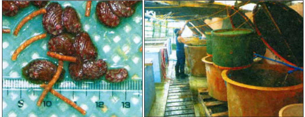
Abalone Juveniles are fed an artificial diet at the hatchery

Locally, abalone dishes are served in some seafood specialty restaurants and commands a high price of PhP 120-150 per serving which consists of only one abalone cut into thin slices. The abalone shell also used for ornamental shellcrafts which are sold locally and abroad.