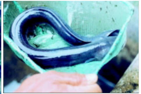
The eel (above) is grown in hapa nets inside a small concrete pond in southern Philippines (left)