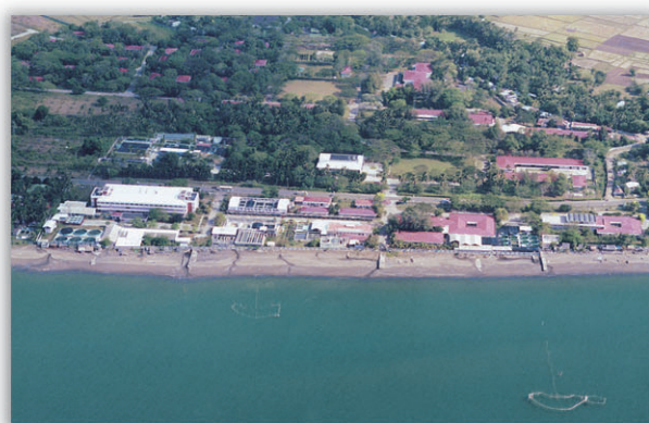
Tigbauan Main Station

The Aquaculture Department in the Philippines maintains four stations: in Iloilo Province, the Tigbauan Main Station and the Dumangas Brackishwater Substation; in Guimaras, the Igang Marine Substation; and in Rizal, the Binangonan Freshwater Station.