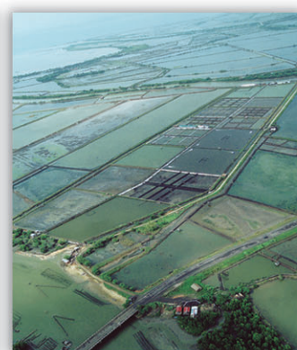
Dumangas Brackishwater Substation