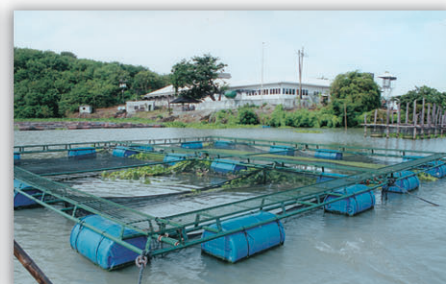
Binangonan Freshwater Station