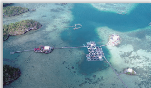
Igang Marine Substation