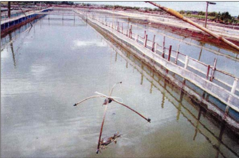
Figure 1. Net enclosure installed in pond showing plastic sheet (about 30 cm) fitted on the inner side of the top end of the net.

In the polyculture of crabs with milkfish, milkfish ponds can be renovated to suit the requirements of both species. Lablab which serves as the natural food for milkfish cannot be grown abundantly at water depth higher than 50 cm. Since water depth of 80-100 cm is required by crabs, ponds may be provided with 100 cm wide x 50 cm deep peripheral and central canals (20-30 % of the total pond area). When the pond is filled with water to a depth of 50 cm the water level in the canals by then is 100 cm. Crabs can seek refuge for cooler temperature in these canals if the water temperature in the pond goes beyond 32°C.