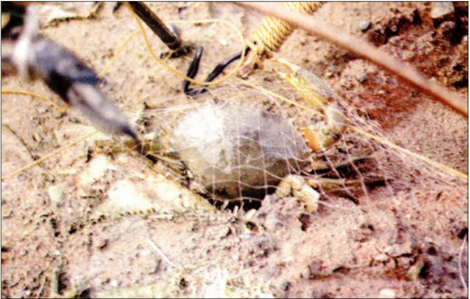
Figure 5. Crab caught by lift net being restrained. The claw of one crab is ready to cut the swimming legs of another. Separations of the claw must be properly handled to prevent damage on appendages of the other crab.