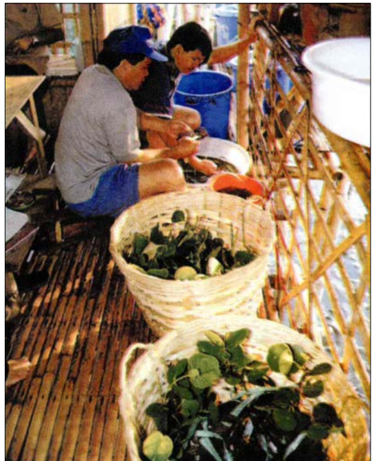
Figure 6. Harvested crabs (weighed) are placed in "bakag" provided with mangrove fronds to keep them cool and moist during transport. The males are already separated from females before they are brought to export buyers.