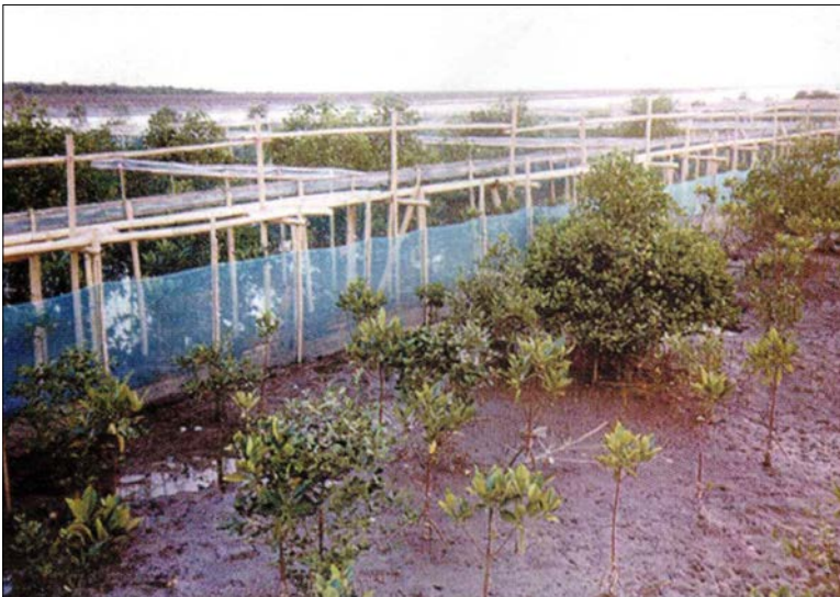
Figure. 2. Pen design allows flooding of the culture area. Finemeshed net surrounds the dike to minimize siltation in the pen canals.