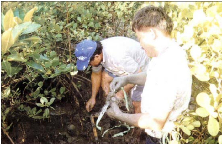
Figure 3. Chelipeds are firmly tied to prevent fighting among crabs.