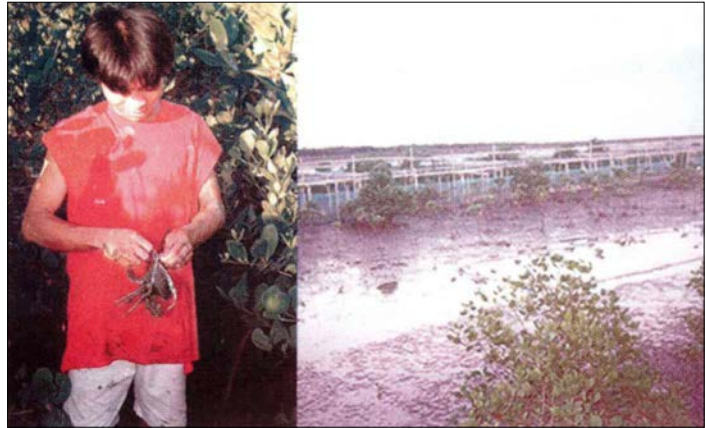
Figure 7. The pens are totally drained at termination of culture and remaining crabs are picked-up manually.