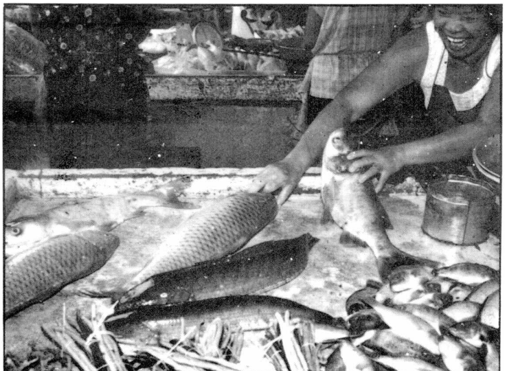
Carps are usually sold live in the market

Convenience food products from bighead carp, the "ready to cook foods" are in great demand. They are prepared for fish sticks, fish spread, fish flakes, (plain and salted), fish powder (smoked and unsalted), smoked fish fillet, pickled smoked carp, ham-cured carp fillets and fish sausage.