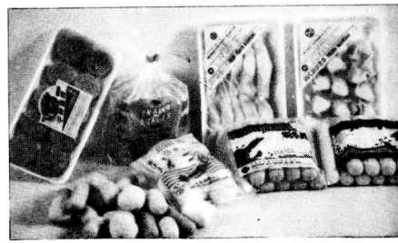
Dept. Fish. Malaysia

the production of fermented fish, fish paste or shrimp paste ( bago-ong ). The salt-fish mixture can be sun-dried or left to ferment in a fermenting vat, earthenware jar, concrete tank, plastic drum, oil drum or oil can.