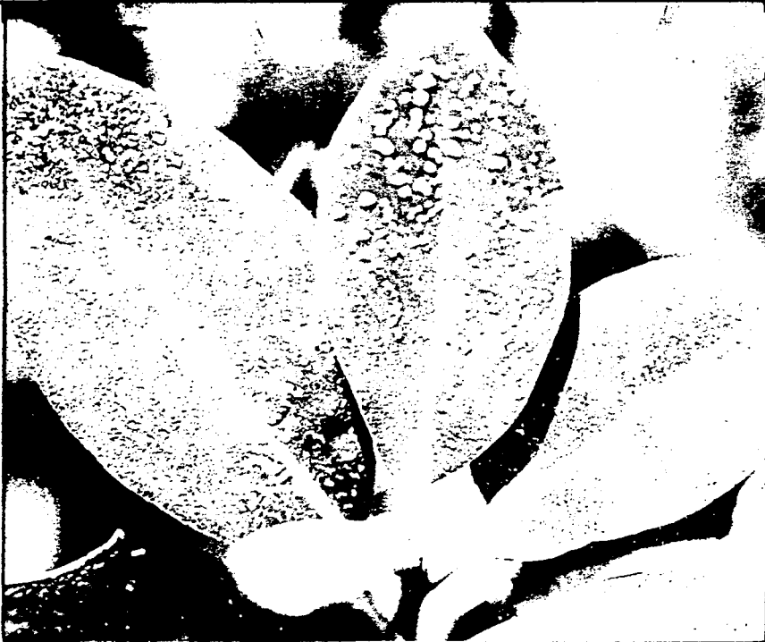
The leathery and thick leaves of mangroves excrete salt from special pores (left) while aerial or prop roots (below) and buttressed trunks (inset) counteract water movement.