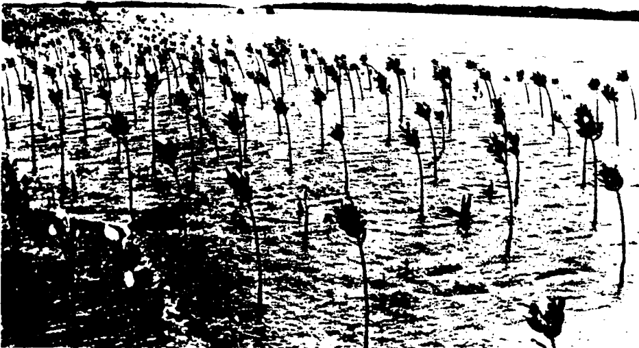
Mangrove reforestation is being done in Dumangas, Iloilo as a project of Iloilo State College of Fisheries (ISCOF).

Source: Bagarinao, T. et al. Towards a viable environment: What individuals can do. SEAFDEC/AQD. (in press).