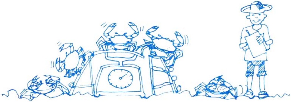
Table 2. Stocking density, survival, and production data for mudcrab monocultured in 100-m 2 ponds