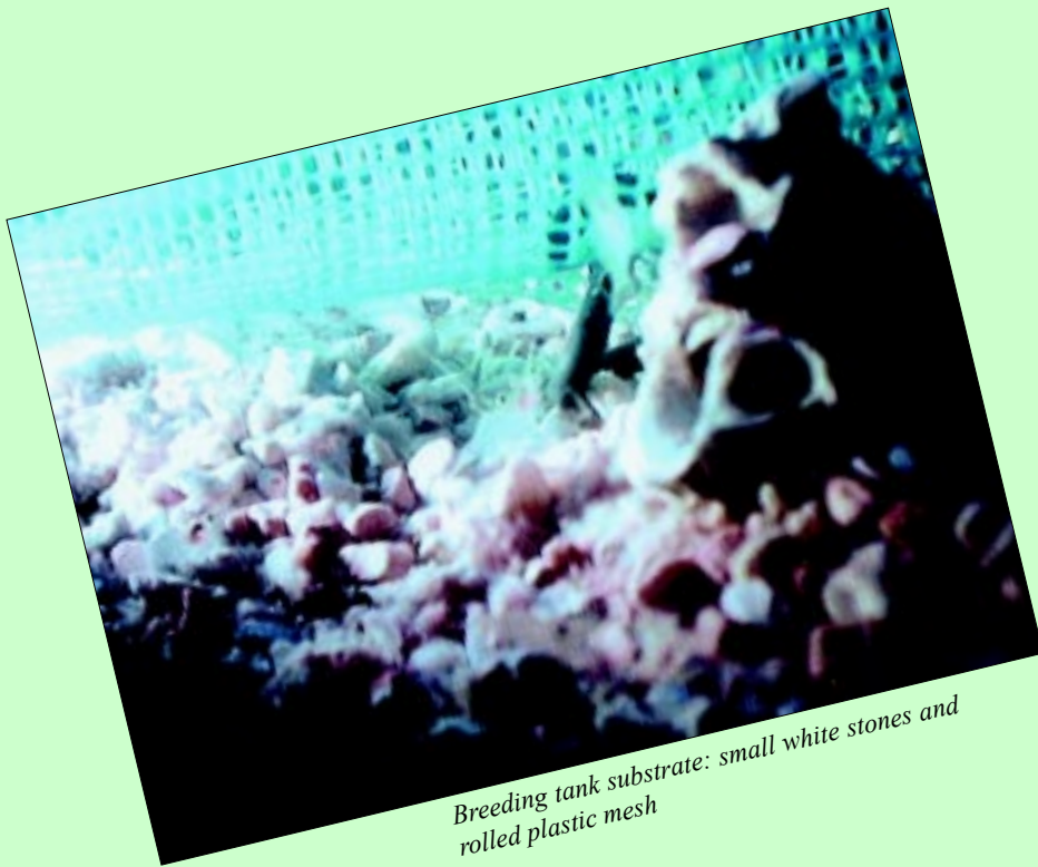
Breeding tank substrate: small white stones and rolled plastic mesh