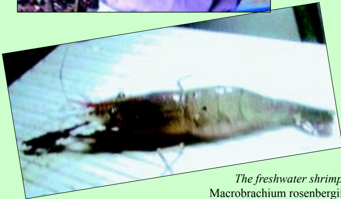
The freshwater shrimp Macrobrachium rosenbergii