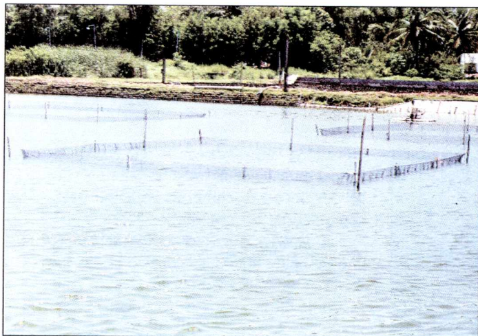
The intensive shrimp pond has four cages stocked with tilapia. The tilapia water controls luminous bacteria in the shrimp pond to levels that do not affect production