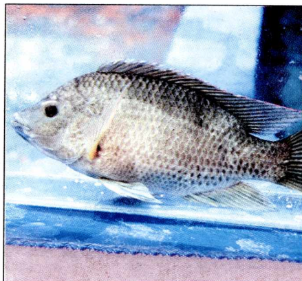
The lowly tilapia may yet put back the glow in the eyes of shrimp farmers who own idle shrimp ponds. It may signal the rebirth of intensive farming and put the Philippines back on the world shrimp map