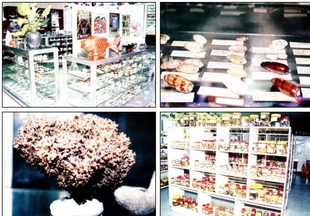
The AQD Museum and Biodiversity Garden attract and entertain visitors, mostly students. Museum collection includes deep sea fishes from the Philippine Trench; mangrove fishes from Quezon; coral reef fishes from Pangasinan; and molluscs from Ifugao, Sorsogon and other places.

conserving rice seeds to maintain genetic diversity, and why scientists are looking at the role of methane emissions from ricefields in global warming. Riceworld was designed with children in mind and was made possible with a US$80,000 grant from the German Technical Cooperation Agency.