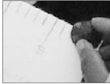
Fig. 2. Measuring basal diameter of topshell.

Results of the interview were pooled together and a descriptive analysis of the