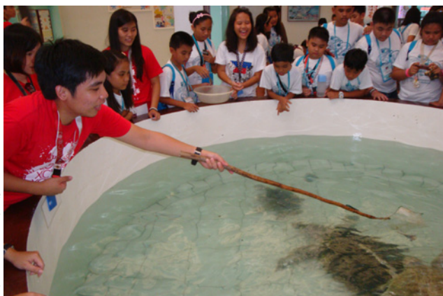
The visitors have fun while feeding the turtles