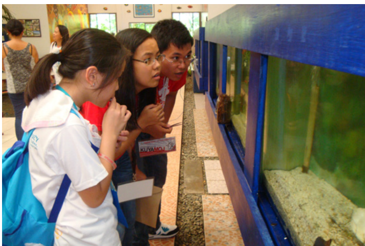
The PSYC organizers vividly watching the behaviour of the animals in the aquaria

The club members also toured AQD's integrated milkfish broodstock & hatchery facility which showcases transferrable aquaculture technologies to fishfarmers.