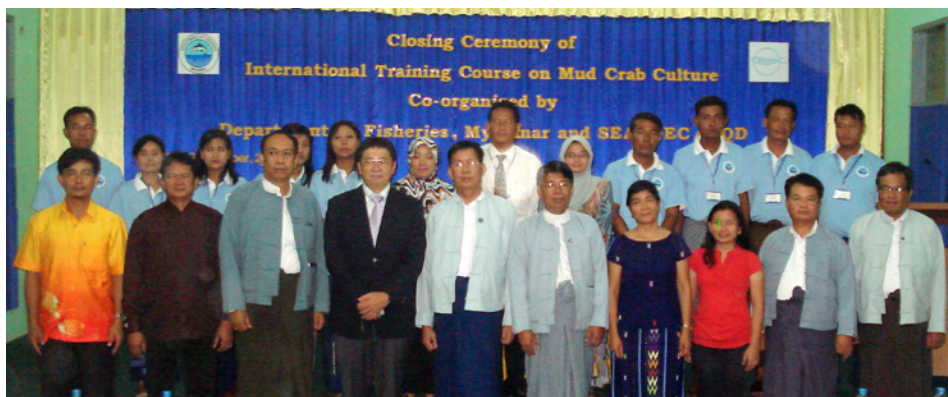
The participants, resource speakers, and DOF staff & officers during the closing ceremony held at the DOF office in Yangon, Myanmar

Newsletter of the SEAFDEC Aquaculture Department, Tigbauan, Iloilo, Philippines