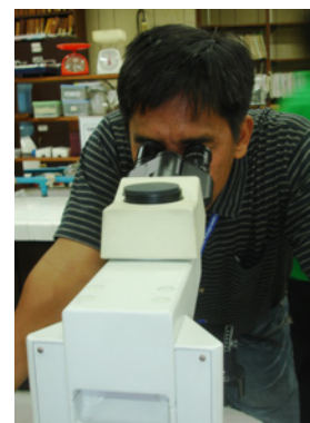
One of the participants monitors the larval condition of the shrimp

coordinator and secretariat). The activity aimed to provide SEAFISH members with better understanding on the science of aquaculture and its socio-economic & environmental impacts.