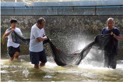
Collection of milkfish broodstock

AQD's facilities and activities at the marine fish hatchery on 17 January. The video on nursery culture of high value marine fish was featured on 26 January and can be viewed at http://www.youtube.com/user/magagritayo . School children from the Kinaadman Elementary School Inc. came as witnesses to the milkfish sampling.