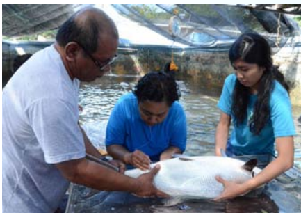
Cannulation of eggs from the milkfish broodstock