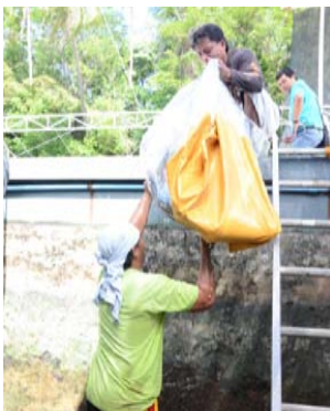
Transfer of broodstock to another tank using a transport bag