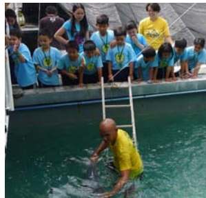
School children from Kinaadman Elementary School Inc. witness the stocking of milkfish in a new clean tank