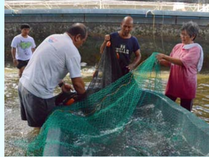
2-phenoxyethanol (100-200 ppm) is used to sedate the milkfish broodstock