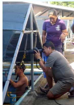
The crew of Mag-agri Tayo prepares to take footages inside the grouper tank