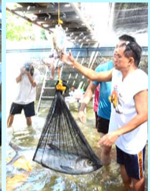
Weighing the fish