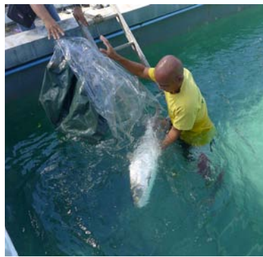
Stocking the milkfish in a new clean tank