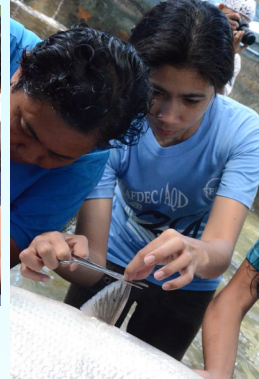
Collection of fin clip for DNA fingerprinting