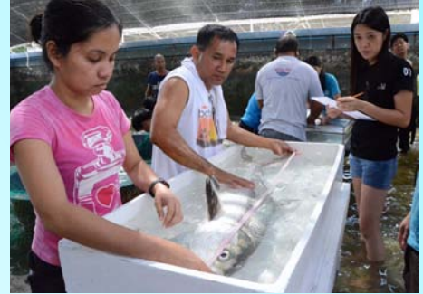
Measurement of the total length