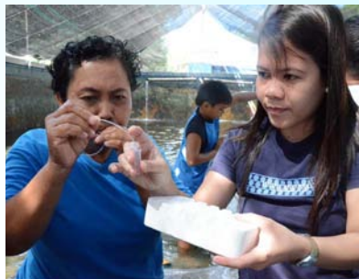
Collection of egg sample