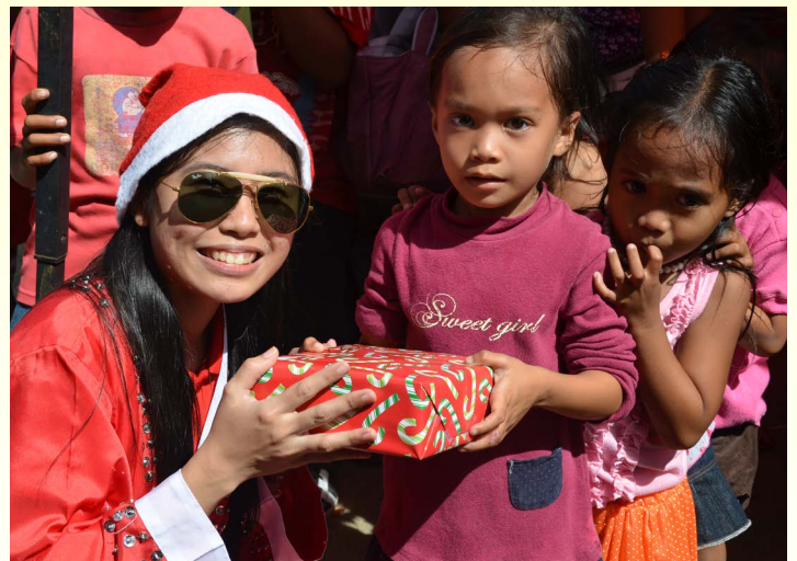
AQD staff distribute school supplies and toys to almost 300 children from Nipa Elementary School and Loong Elementary School