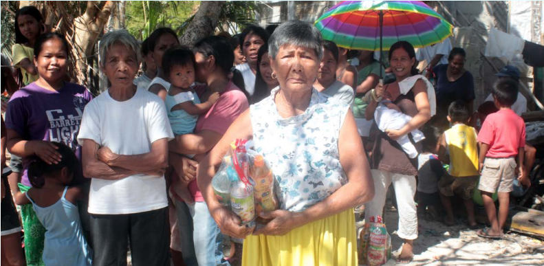
Residents of Ajuy receive relief goods from AQD