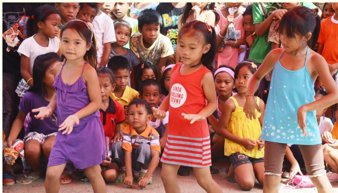
The children give a special dance number during the party

AQD management thanks all the people who helped in sharing the true spirit of Christmas.