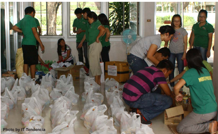
AQD employees pack relief goods gathered from the donation boxes for the victims of typhoon Yolanda