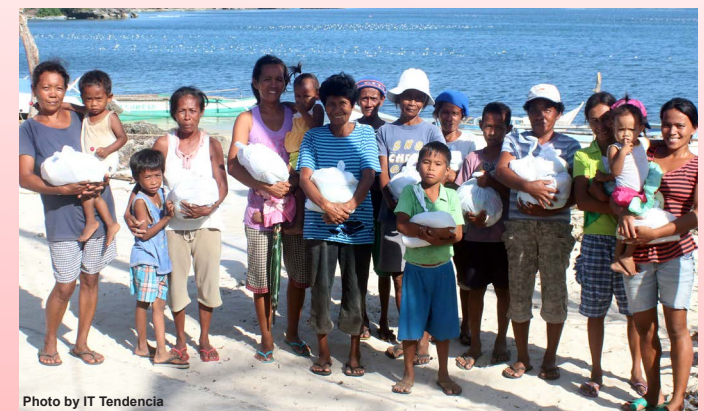
The residents of Caluya, Antique likewise receive relief packs on 18 November