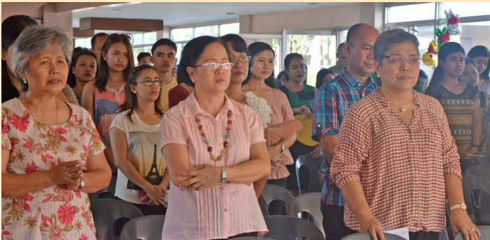
AQD staff attend the thanksgiving mass on 13 December