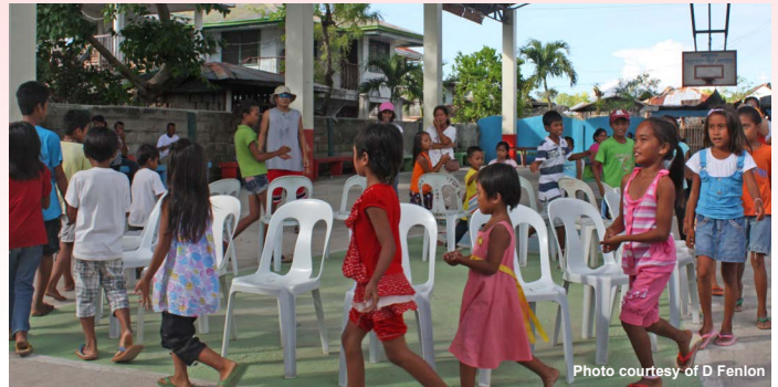
Children enjoy playing one of the parlor games called "Trip to Jerusalem"; they also received Christmas gifts