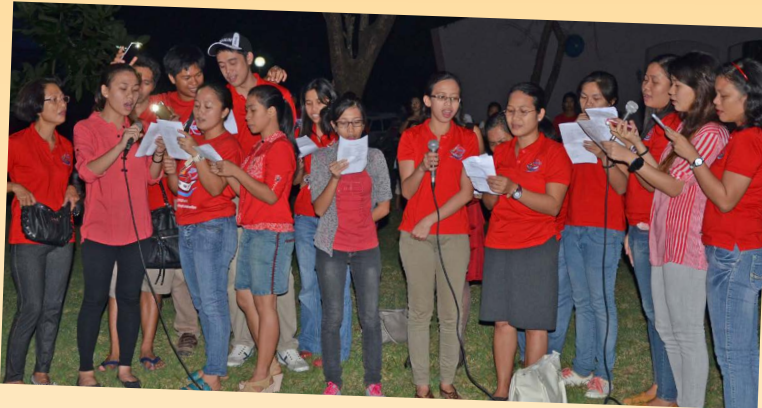
AQD employees sing "Pasko para sa lahat" and "Pasko na naman" during the community singing