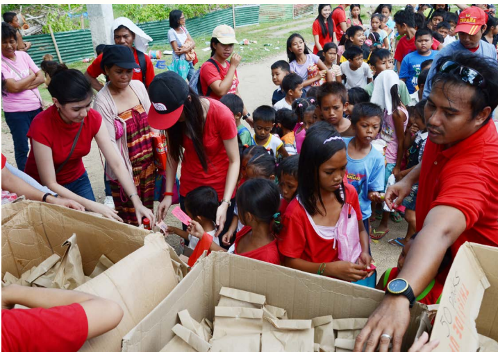
After the parlor games AQR staff distribute snacks to the children