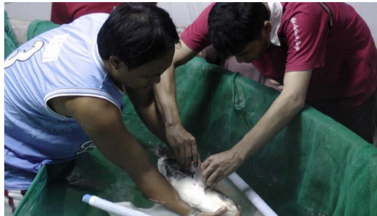
Participants during their practicals on carp induced spawning