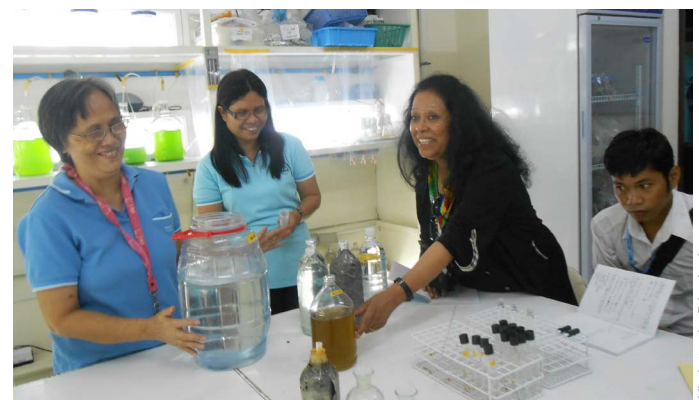
A practical session on natural food production