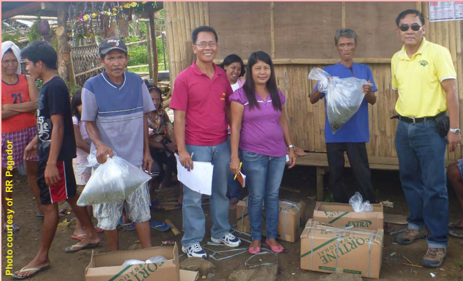
AQD helps rehabilitate the cages of the affected tilapia fishfarmers in Dumarao by giving 13,000 tilapia fingerlings, 4 sacks of tilapia starter feeds, 4 units of 5 x 5 used B-net & hapa net, 2 rolls of new black net and hapa net on 17 December