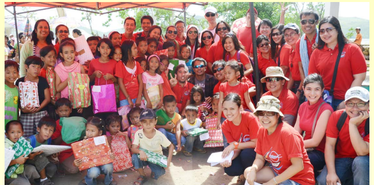
AQD shares the spirit of Christmas with the children of Concepcion through a Christmas party and gift-giving activity held 14 December