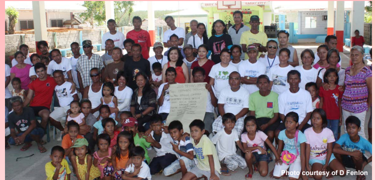
AQD also hosted a Christmas party that bring joy to the affected members of BFARMC (Barangay Fisheries and Aquatic Resource Management Council) in Molocoboc Island, Sagay on 10 December. Twenty-six active members receive hygiene kits and gift certificate of materials for rebuilding their homes