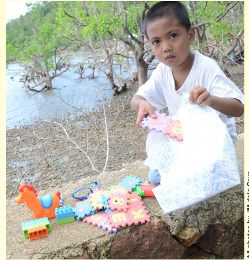
A boy opens his gift full of toys