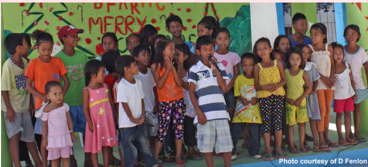
The children of BFARMC members present a special song number