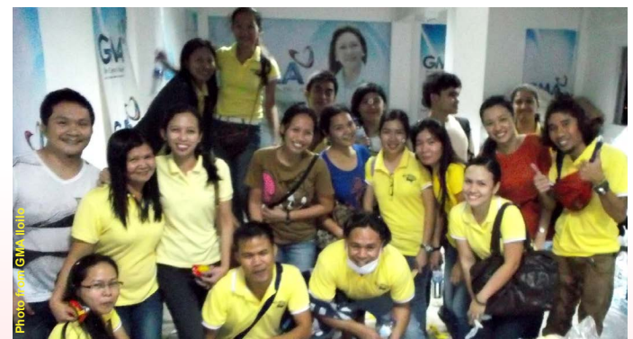
AQD staff also help in the repacking of relief goods at GMA Iloilo (local TV station) on 12 November