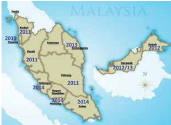
Figure 1. Chronological order (year) of AHPND occurrences in Malaysia confirmed by histopathology