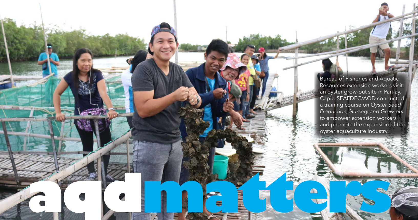
Bureau of Fisheries and Aquatic Resources extension workers visit an oyster grow-out site in Pan-ay, Capiz. SEAFDEC/AQD conducted a training course on Oyster Seed Production, Nursery and Grow-out to empower extension workers and promote the expansion of the oyster aquaculture industry.