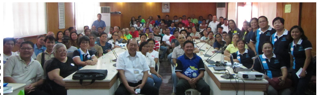
SEAFDEC/AQD resource persons and participants (from the LGU, private sector and academe) of the Aquaculture Technology Forum during the 61st Aklan Day celebration