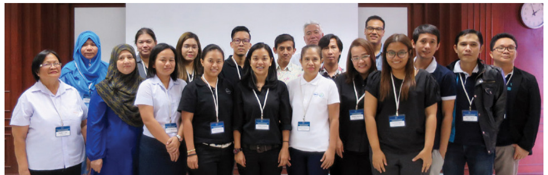
The participants of the SEAFDEC Inter-Departmental Workshop on the Establishment of Institutional Repository