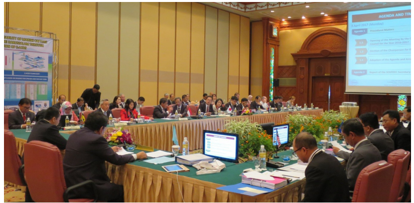
Participants of the 49th SEAFDEC Council Meeting during round table discussions