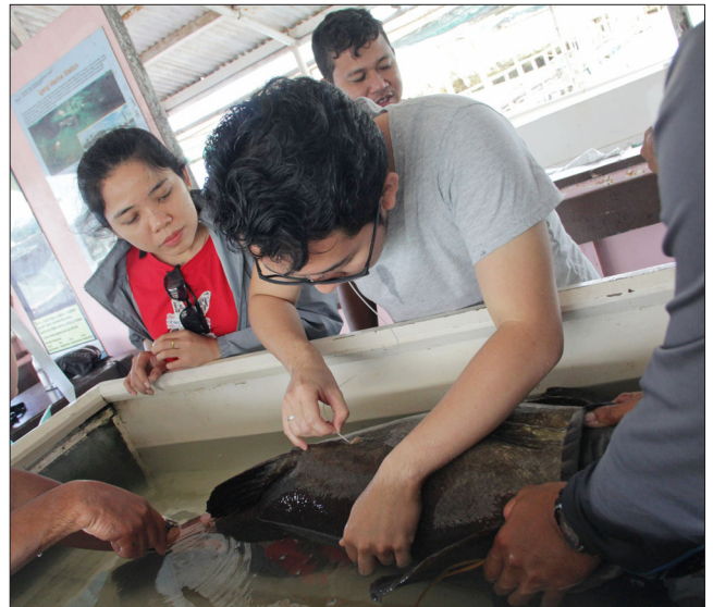
Biopsy of giant grouper is done by inserting a plastic cannula into the genital opening to check for the presence of eggs.

BENEATH the turquoise waters of Igang Bay in Guimaras Island dwell one of the most feared species of fish in the Philippines. Indeed, urban legend has it that this brown behemoth fish sprinkled with dark spots, which can grow up to 2.3 meters in length and 400 kilograms in weight, is responsible for several human disappearances.