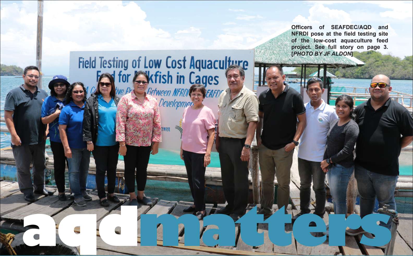
Officers of SEAFDEC/AQD and NFRDI pose at the field testing site of the low-cost aquaculture feed project. See full story on page 3.