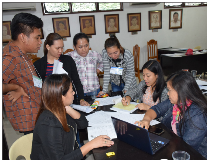
Participants prepare a research proposal as their final output for the training course.