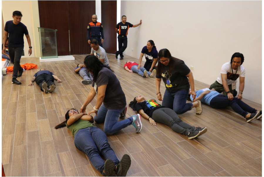
SEAFDEC/AQD employees actively participate during the simulation exercises of the Fire Brigade Training.

TO INCREASE the awareness of employees on what to do during fire, earthquake, or other emergencies, SEAFDEC/AQD's Human Resource Management Section (HRMS) in coordination with the Bureau of Fire Protection (BFP) of Tigbauan Fire Station facilitated a three-day intensive Fire Brigade Training on 2, 3, and 7 May 2019 at SEAFDEC/AQD Multi-Purpose Hall.