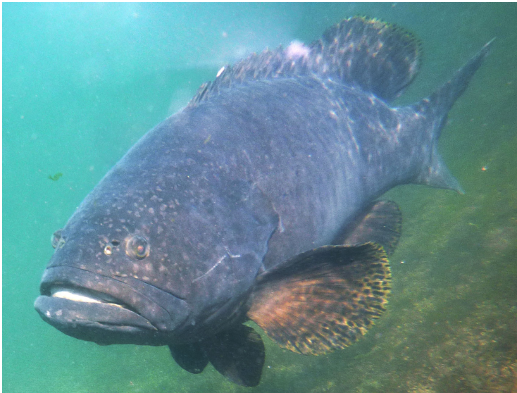
One of the giant grouper ( Epinephelus lanceolatus ) in the broodstock cages at the Igang Marine Station. A non-invasive technique developed at SEAFDEC/AQD recently allows for easier determination of giant grouper sex.