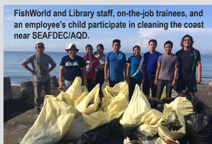
FishWorld and Library staff, on-the-job trainees, and an employee's child participate in cleaning the coast near SEAFDEC/AQD.

The “Month of the Ocean” is celebrated annually in the Philippines during the month of May. This year is the 20th anniversary of MOO with the theme “Free the sea from marine debris.” a