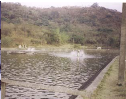
Shrimp (left) harvested from one of the three Siochi's ponds (right)

AQUA DEP'T NEWS is published weekly by DEVCOM, TID at the Tigbauan Main Station. Editor this issue: CB Lago; Circulation: E Gasataya; Photography: R Buendia (unless otherwise credited)