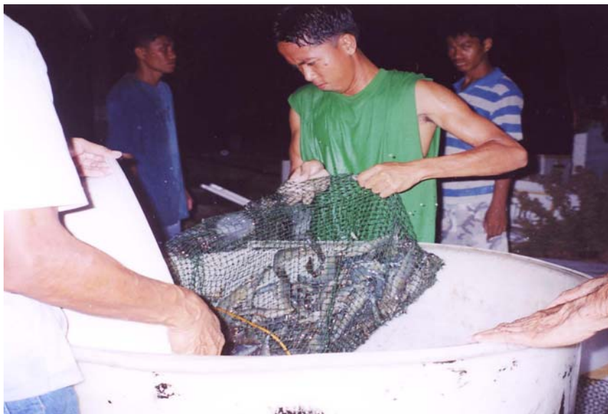
Shrimp harvest at Siochi's farm in Nasugbo, Batangas