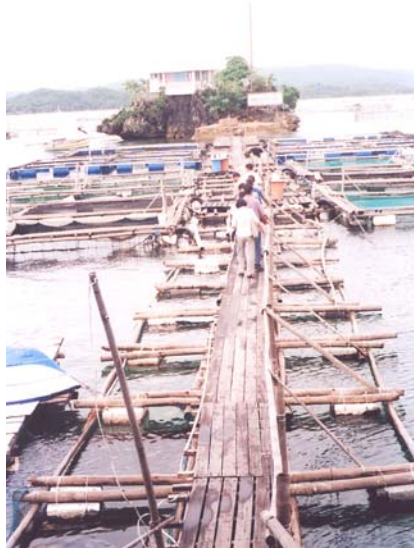
AQD's Igang Marine Sub-Station

The Sangguniang Bayan of Nueva Valencia, Guimaras passed a resolution allowing AQD to undertake demonstration and training programs on mariculture technology that is ecologically and environmentally-friendly in Igang, Nueva Valencia, Guimaras.