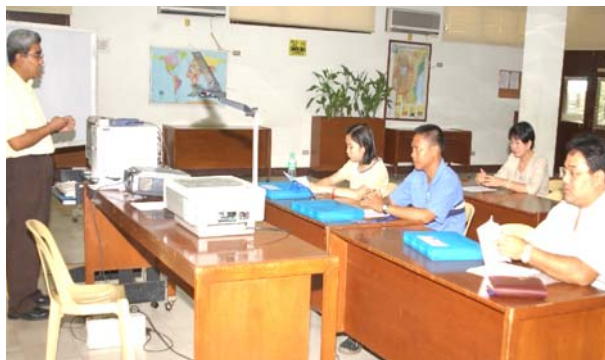
Participants of the training course

The training course Management of Sustainable Aquafarming Systems started on May 7 at TMS.