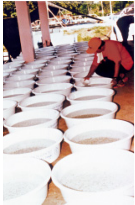
A harvest of milkfish fry from the hatchery