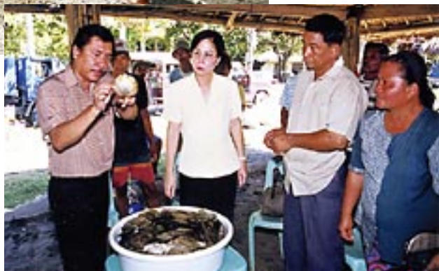
Efforts to revive the kapis industry