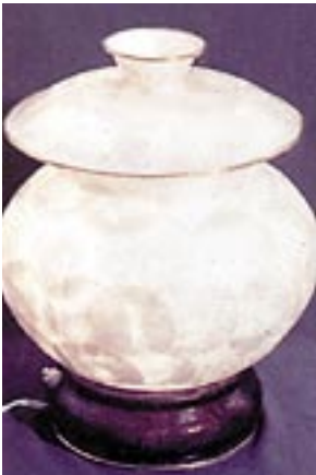
Uses of kapis shells