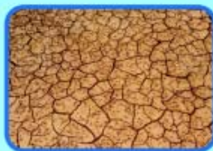
Dried pond bottom

First is, thorough pond prep: dry, plow, harrow, and flush in several cycles, then apply lime (hydrated, ~ 2 t/ha) to pond and canals, in between cycles. White Spot carriers - wild crabs and small shrimps, should be removed. During culture, avoid trash fish feeding.