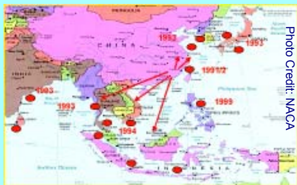
The Asian White Spot pandemic

First reported in China and Japan in 1993, most shrimp farming countries already have it. Due to loose compliance with regulations on transfer of live shrimp, its spread throughout the world was a matter of time. It is now in the country to stay.