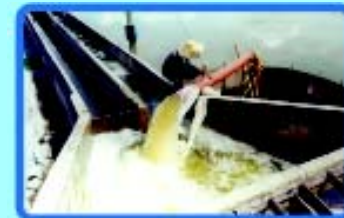
Screened reservoir water

Third , maintain green water in your shrimp and reservoir ponds to control luminous bacteria; it aggravates White Spot. About 2 t/ha tilapia in the reservoir ensures green water. Also, tilapia-in-pen inside the shrimp pond helps maintain green water.