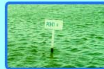
Green pond water

Third , maintain green water in your shrimp and reservoir ponds to control luminous bacteria; it aggravates White Spot. About 2 t/ha tilapia in the reservoir ensures green water. Also, tilapia-in-pen inside the shrimp pond helps maintain green water.