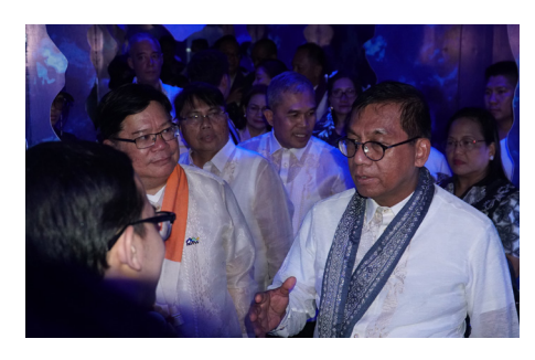
DOST officials grace the SEAFDEC/AQD display of cultured commodities at the NSTW Week.

A N aquarium tunnel displaying various types of fish, invertebrates, and seaweeds, all cultured by SEAFDEC/AQD, were a hit during the National Science, Technology, and Innovation Week celebration launched in Iloilo City on 22 Nov. 2023.