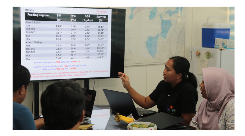
The IFRDMD delegation engages in discussions with AQD experts in the area of technical cooperation during their visit to the AQD headquarters in Tigbauan, Iloilo.