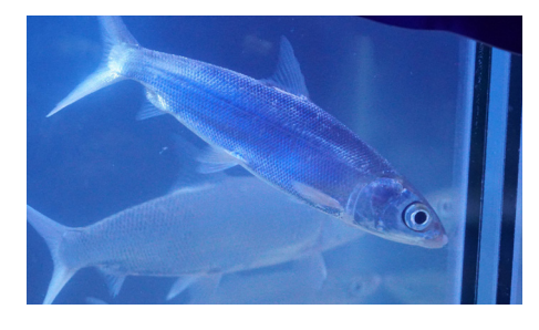
SEAFDEC/ AQD showcases Milkfish juvenile during the NSTW Week proving the department's milestone as the first one to hatch the said fish in captivity.