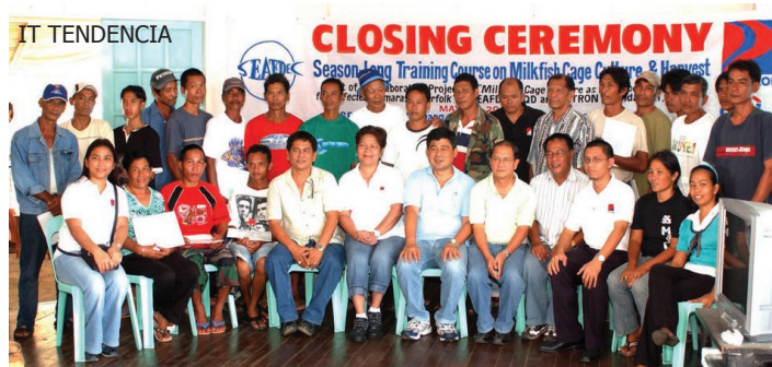
Guimaras fisherfolk-trainees gather with Petron and AQD staff for a group picture during the closing ceremony of the Season-long training course on milkfish cage culture

The participants come from two fisherfolk organizations whose livelihood was affected when an oil tanker sank off the coast of Guimaras last August 2006 spilling hundreds of thousands of liters of bunker fuel to the sea.