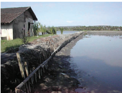
Above: One of the ponds owned by a SANAMSIM member in Mindoro Oriental where soil samples were taken.

AQD recommended an intensive training course on pond culture for the SANAMSIM operators and technicians, and the conduct of an on-site technological demonstration of aquaculture production systems.