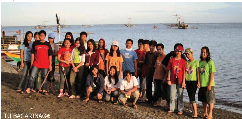
Sunrise finds the students at Atabay fishing village

It was a tough 20 days of hands-on training in marine science and 24 high-tech adolescents appreciated the experience. Now, let’s see if any of that sticks with them.