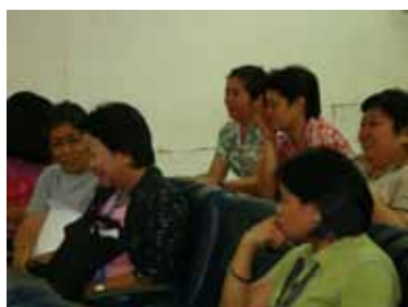
Some of the AQD Senior staff present

A follow-up meeting of senior staff with the Chief was made on January 21 with attendance monitoring and publication requirement for senior RD and TVDD staff as the agenda. As a result, the Chief created an ad hoc committee on January 22 to review existing policies on attendance monitoring.