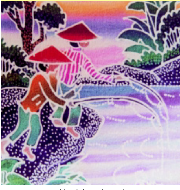
A postcard from Indonesia by an unknown artist courtesy of CR Lavilla Torres

be undertaken in 27,427 ha of brackishwater areas.