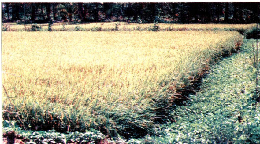
The Demerin (above) and the Garin integrated farms in west central Philippines

be sold at P 70 per kilo. The kangkong grown in the peripheral canals also supplied domestic consumption and the local market. Vegetables (squash, okra, string beans) were also planted on the dikes that surrounded the rice field.