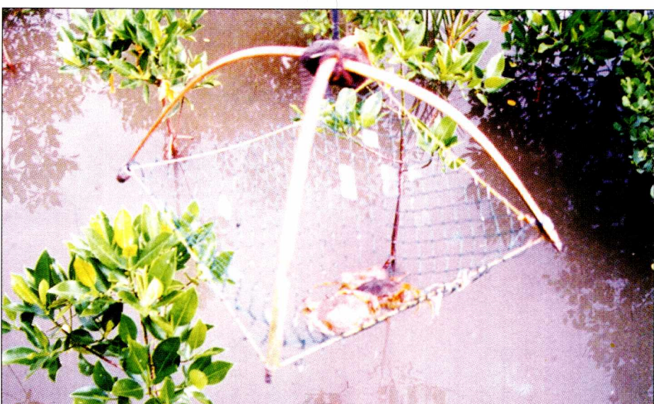
AQD's mudcrab-mangrove farm site in Kalibo, Aklan.