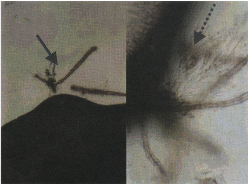
Figure 1. A red algal epiphytes (left away) Polysiphonia and diatoms (right away) on Kappaphycus thalli.

Epiphyte infestation. Epiphytes refer to organisms, small or large, that colonize the surfaces of seaweeds. A serious case of epiphytism has been reported very recently in Calaguas Is., Camarines Norte, and in many parts of the Bicol region. Is this another threat to seaweed farming? Figure 1 shows a common red algal epiphyte, Polysiphonia (with dark arrows) and diatoms (broken-line arrow) on Kappaphycus thalli. The Polysiphonia epiphytes create small, slightly elevated pores on the surface. These pores give "goosebumps" appearance on the thalli surface.