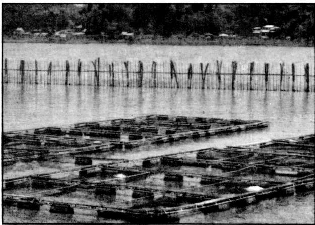
Carp in floating cages (inset) at SEAFDEC/AQD's Binangonan Freshwater station in Laguna de Bay, the largest lake in the Philippines