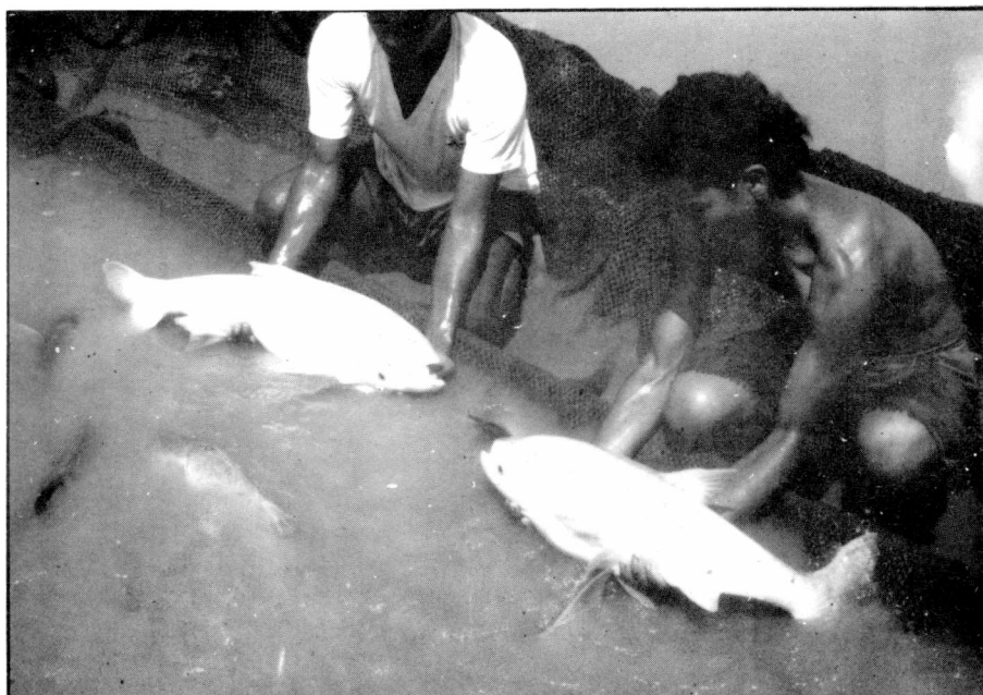
Selection of sexually mature broodstock of cage-reared bighead carps.