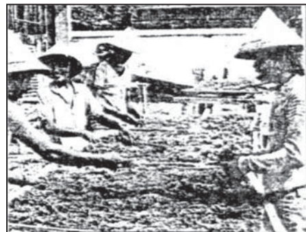
Village folks dry seaweeds for agar processing.

Seaweed collected from natural seaweed grounds, or from a seaweed farm, was cleaned and fully dried in the sun, so that it could be stored for (3-6 months). Before processing, the seaweed was washed and then soaked in freshwater for several hours until soft. It was then heated in freshwater, the time depending on the amount and variety of seaweed. After heating, the seaweed was filtered through a cloth with a screw press. The filtration had to be done quickly, and the screw press pre-heated with hot water to prevent the agar solution from setting during the process. The agar formed a gel after cooling. To remove the water from the agar, the gel was enclosed in a thick filter cloth and put under pressure either in the screw press or between two planks weighted with heavy stones for larger quantities. This process takes at least half a day, after which the agar needs drying in the sun for several days.