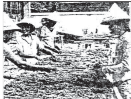
Village folks dry seaweeds for agar processing.

Seaweed collected from natural seaweed grounds, or from a seaweed farm, was cleaned and fully dried in the sun, so that it could be stored for (3-6 months). Before processing, the seaweed was washed and then soaked in freshwater for several hours until soft. It was then heated in freshwater, the time depending on the amount and variety of seaweed. After heating, the seaweed was filtered through a cloth with a screw press. The filtration had to be done quickly, and the screw press pre-heated with hot water to prevent the agar solution from setting during the process. The agar formed a gel after cooling. To remove the water from the agar, the gel was enclosed in a thick filter cloth and put under pressure either in the screw press or between two planks weighted with heavy stones for larger quantities. This process takes at least half a day, after which the agar needs drying in the sun for several days.