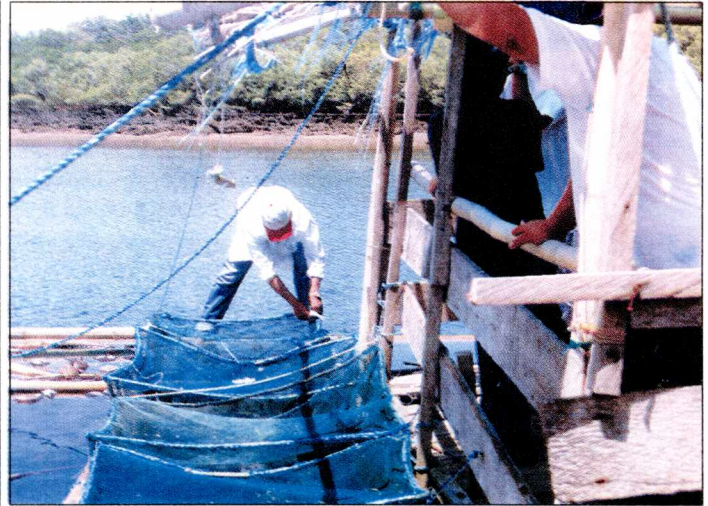
Near the searanch, grouper fingerlings are being raised in nylon net cages by the Mandaragat fishers association