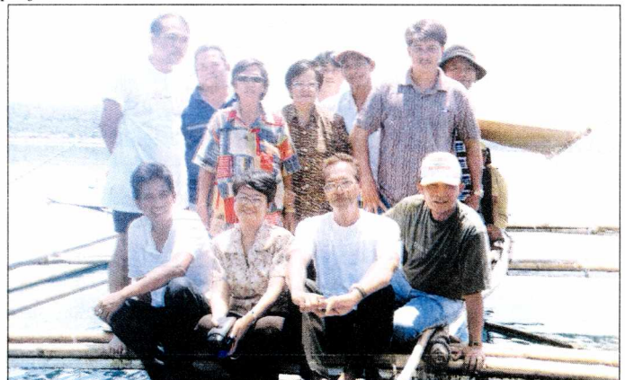
The project actors and other local government staff in their visit to the searanching project site