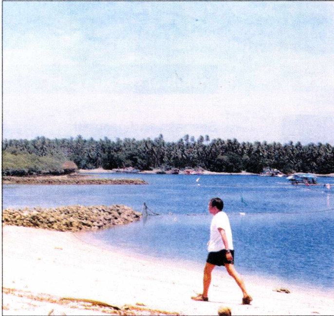
The searanching and sanctuary project covers a 2-ha area fenced by coral dikes at the shallow portion near the shoreline and net enclosures toward the deeper portion of the sea bottom. At the background is part of the 12-ha mangrove area that connects to the searanch. Twelve grouper breeders are stocked in the enclosure and spawning has been observed

fry can easily go back to the sea as the holes in the net enclosures are big enough for them to pass through but small enough for the breeders to escape. Thus, the fishers believe that there will be more fry growing into adults in the wild.