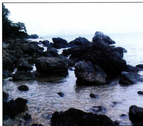
One of the marine sanctuaries visited was in Tibigbas, Libertad, Antique. It is 1 ha x 400 m x 15 fathoms. Installed in 1 April 1999, it now boasts of a proliferation of shellfishes which the fisherfolks gather for family consumption and even for sale. Residents say that the sanctuary has two resident lionfishes

Today, LIPASECU has several projects. Among them are resource conservation and rehabilitation, livelihood enhancement, waste management, law enforcement and sea patrol, institution build-