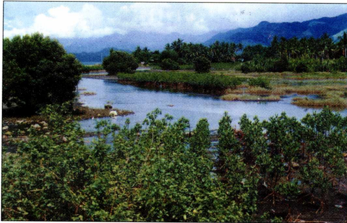
Mangrove reforestation project in Lipata, Culasi. Growth of the mangrove trees is not good. AQD consultant Wilfredo Yap explains that the species planted may not be suitable to the site