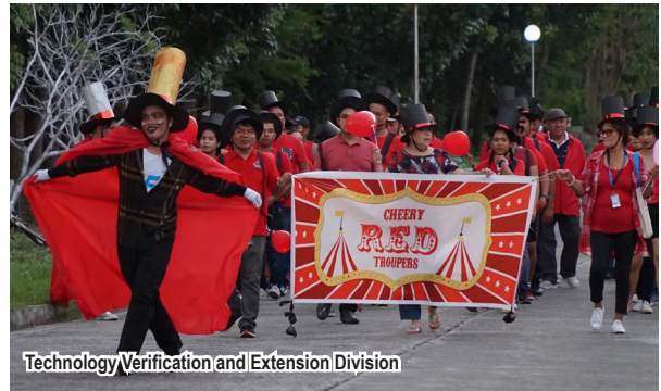
Technology Verification and Extension Division