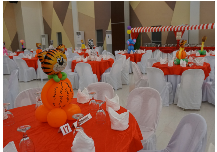
AQD's Multi-purpose Hall was adorned with fun designs converting the venue to a Fun Town.