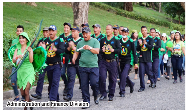
Administration and Finance Division