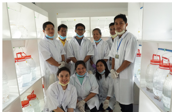
BFAR technical staff train in AQD's seaweed laboratory at Tigbauan, Iloilo