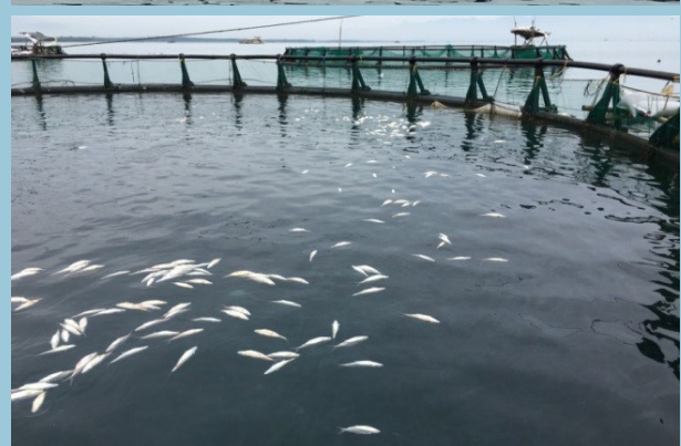
Few of the fish cages with high mortality in Alabel, Saranggani last 19 November 2018