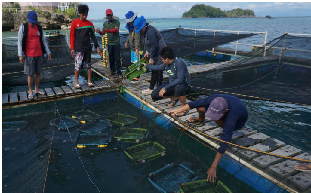
BFAR trainees experience seaweed culture at AQD's Igang Marine Station in Guimaras

To intensely address the problem on the shortage of quality seed material (propagules) and increase productivity and profitability within the seaweed sector, nine technical staff of the Philippine Bureau of Fisheries and Aquatic Resources (BFAR) attended a 10-day training course at SEAFDEC/AQD.