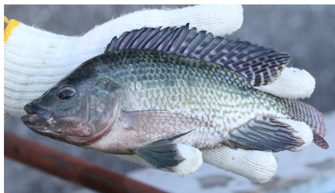
Tilapia produced at AQD's nursery