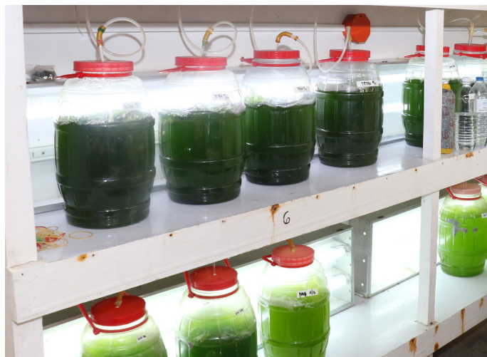
Algal containers at AQD's natural food laboratory

The Inland Fishery Resources Development and Management Department (IFRDMD) of SEAFDEC in Palembang, South Sumatra, Indonesia requested a specialized training course on algal culture from the Aquaculture Department (AQD) in Tigbauan, Iloilo, Philippines.