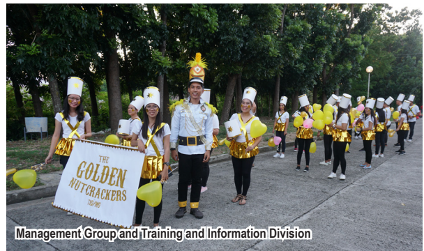
Management Group and Training and Information Division