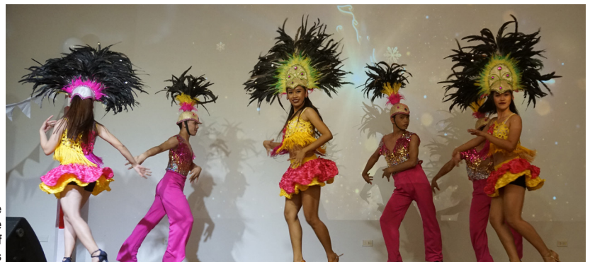
Irong-irong Dance Troupe entertains the AQD family with a set of lively dance numbers