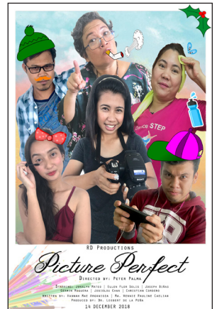
TVED's Madmad won Best Poster and RD's Picture Perfect won Best Picture