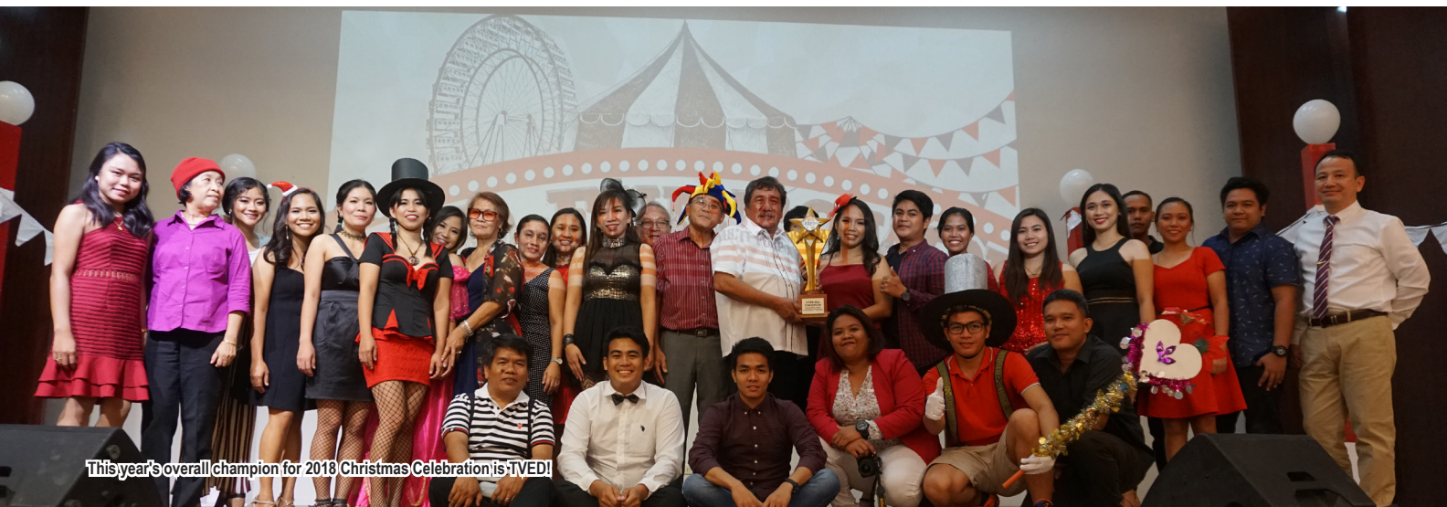
This year's overall champion for 2018 Christmas Celebration is TVED!