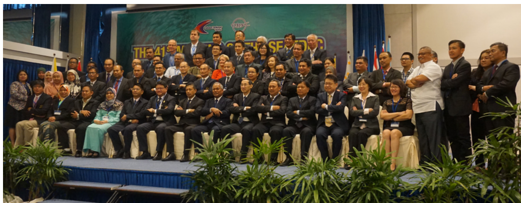
Participants from SEAFDEC member countries gather during the 41 st Program Committee Meeting in Langkawi, Malaysia

LANGKAWI, Malaysia – Member countries requested for various partnerships and collaborations from SEAFDEC/AQD during the Program Committee Meeting last 5 to 7 November 2018. Following the department's presentation of its accomplishments and ongoing activities for 2018, member countries expressed further to learn more about these projects.