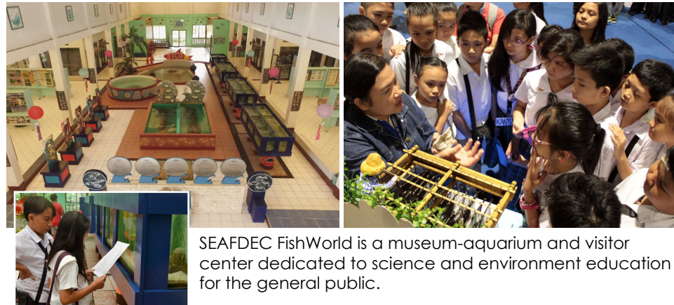
SEAFDEC FishWorld is a museum-aquarium and visitor center dedicated to science and environment education for the general public.

The SEAFDEC/AQD Website ( www.seafdec.org.ph ) and Institutional Repository ( repository.seafdec.org.ph ) bring aquaculture technologies, including downloadable publications, to the internet where they are readily searchable and viewed. The latest farmer-friendly manuals, textbooks, posters and brochures are available at the AQD Bookstore or in different fairs and exhibits participated in by AQD.