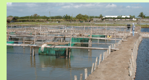
SEAFDEC/AQD's floating net cages in Igang Marine Station (top) and brackishwater pond in Dumangas Station (above)