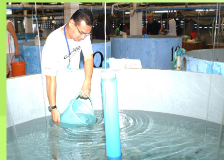
SEAFDEC/AQD's multi-species marine fish hatchery