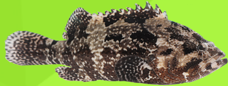
Brown-marbled grouper or tiger grouper Epinephelus fuscoguttatus

G roupers ( Epinephelus spp.), locally known as lapulapu or inid , are high-value species with great potential in aquaculture. They are valued for their excellent texture and flavor. The demand for grouper in the local and international market is fast growing particularly in Hongkong, Japan, Taiwan, Korea and Singapore. Fry is also potentially available anytime of the year since broodstock spawn all year round.