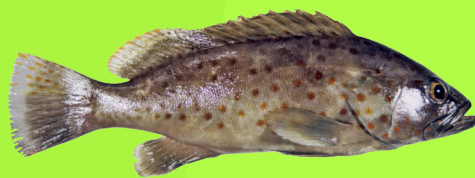
Orange-spotted grouper or green grouper Epinephelus coioides