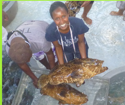
Trainee on Marine Fish Course holding grouper broodstock

G rouper culture has three phases (1) the hatchery rearing where larvae are reared from hatching until 60 days, (2) the nursery rearing where fish is cultured for 1-2 months, and (3) the grow-out stage where fish is reared for 6-8 months. Grouper should be sorted and size-graded during the late hatchery and nursery stage to prevent cannibalism. Other routine procedures include feeding, net maintenance, stock sampling, and monitoring water quality. Groupers can reach the market-size of 300-350 grams in 5-7 months when 2.5-3 inches fry are stocked.