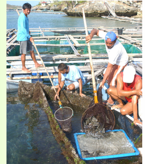
Grouper harvest in floating net cages