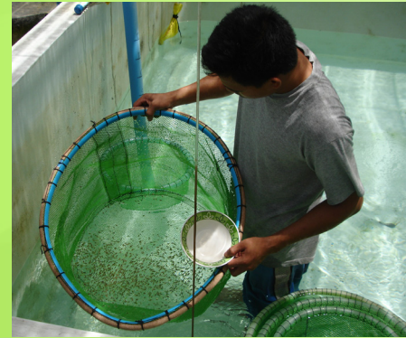
Collecting of grouper fry in rearing tanks