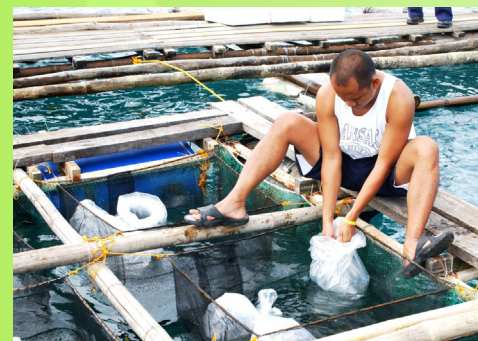
Acclimatizing grouper juveniles in floating net cages

10% of average body weight (ABW) or artificial diet at 3% ABW, with half of the ration given early in the morning and the other half late in the afternoon