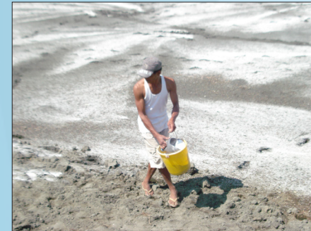
Application of lime in a pond