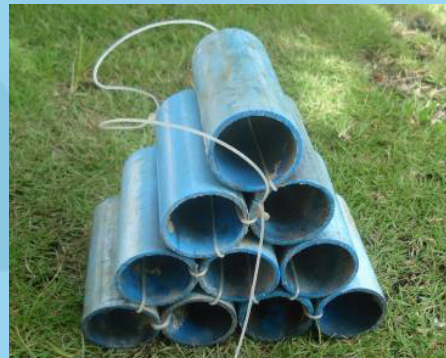
PVC cuttings as fish shelter