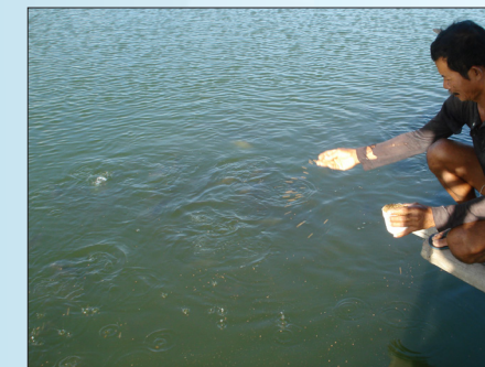
Feeding of snappers stocked in a pond