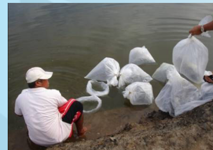
Acclimation of snapper juveniles in a pond