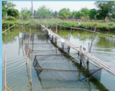
Net cages in a nursery pond