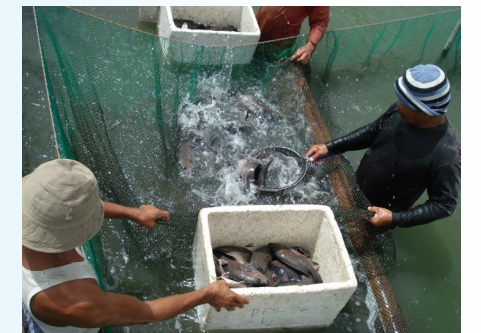
Harvest of snapper